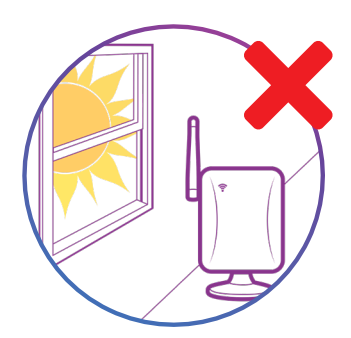
Not in direct sunlight